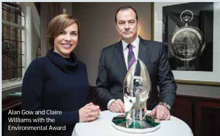
Alan Gow and Claire Williams with the Environmental Award

The governing body is seeking nominations for the 2017 MSA Environmental Award, which recognises truly exceptional or outstanding contributions towards environmental responsibility and the active promotion of sustainability within motor sport activities, events and communications.