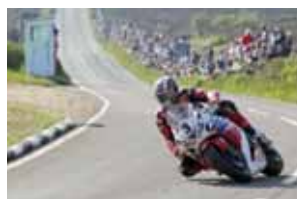
Bike world mourns before TT...