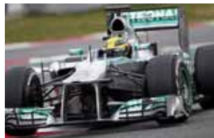
Merc continue the charge....