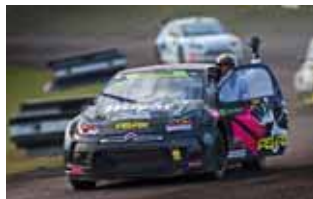
Petter back to winning ways....