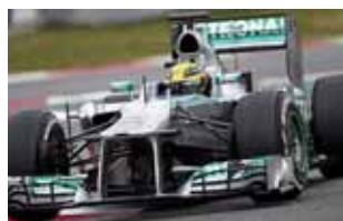
Merc continue the charge....