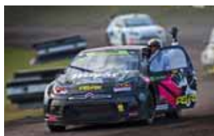
Petter back to winning ways....