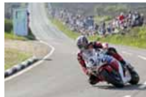
Bike world mourns before TT...