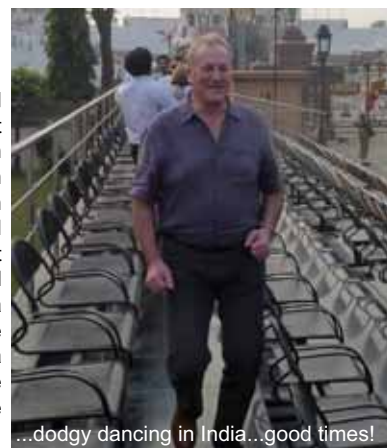
...dodgy dancing in India...good times!