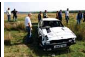
Lots going on @CroftCircuit..... AutoSolo - fast approaching... Championship protests - again!!